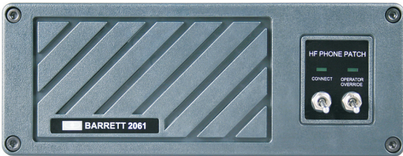
Barrett 2061 Phone Patch front panel