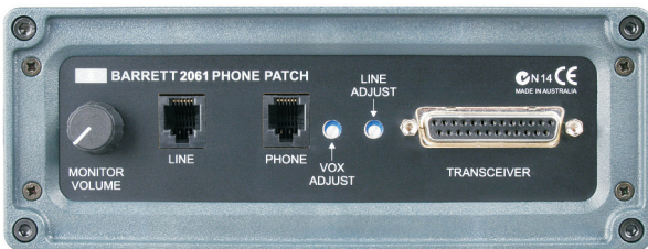
Barrett 2061 Phone Patch rear panel